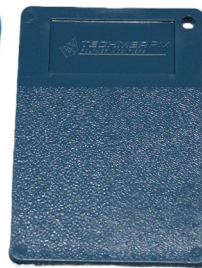
With antimicrobial No color adjustment