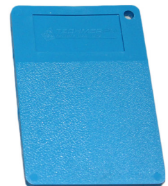
CupronColor *With antimicrobial and color adjustment